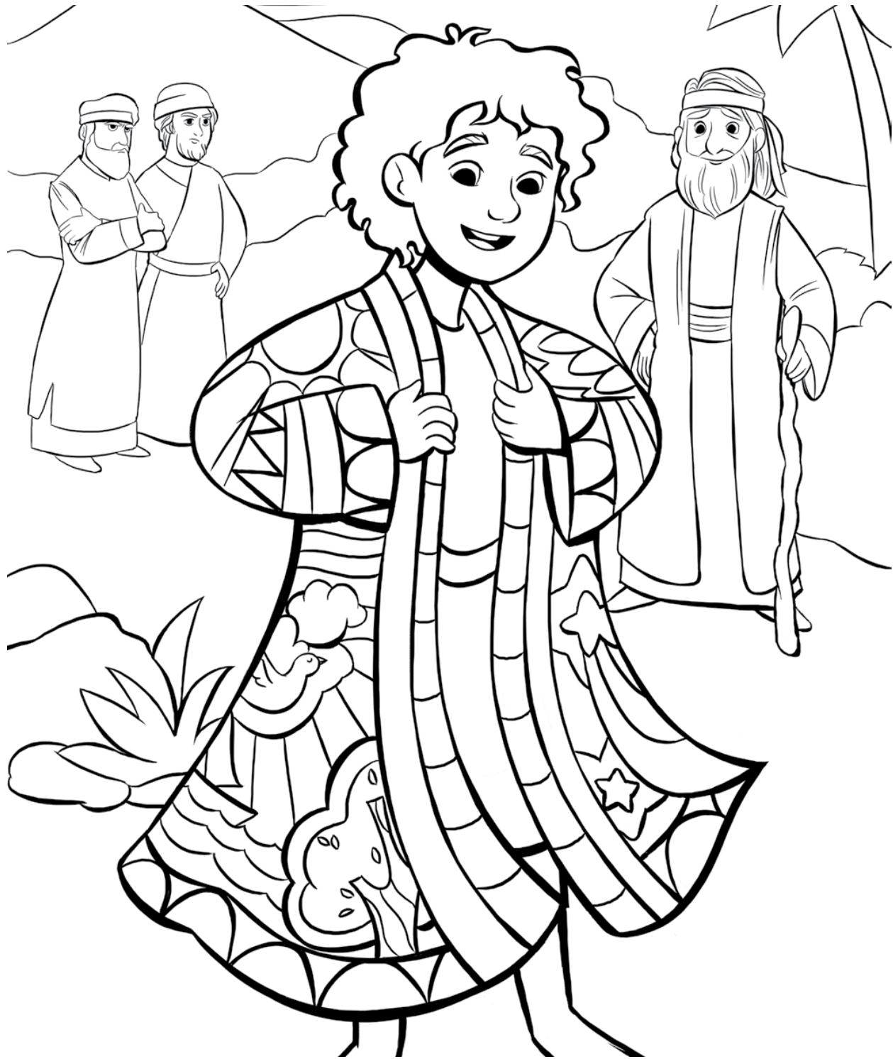
Joseph and His Brothers